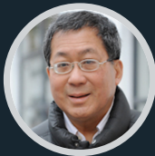
Dato Dr. Ken Yeang